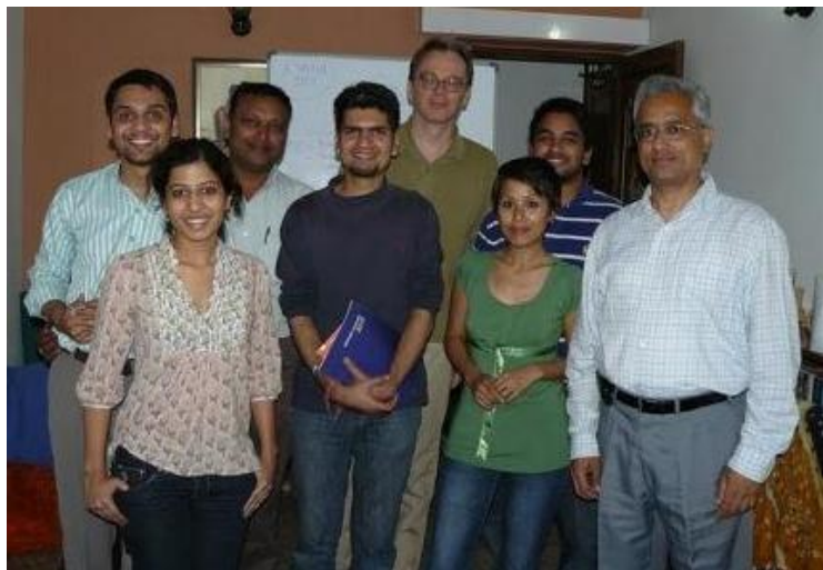
3 March: A talk on FTI at Chintan, Centre for Civil Society (the event was video-taped)