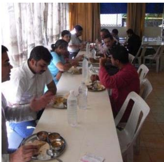
Lunch hour at the Conference

For those who want to work for FTI goals but do not wish to contest elections or involve themselves in full time advocacy, the Freedom Partners membership category will become the key vehicle. A greater boost needs to be given to Freedom Partners in 2010, with reduced emphasis on Adharshila.