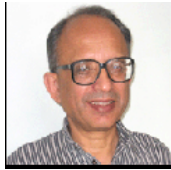
Swaminathan S. Anklesaria Aiyar