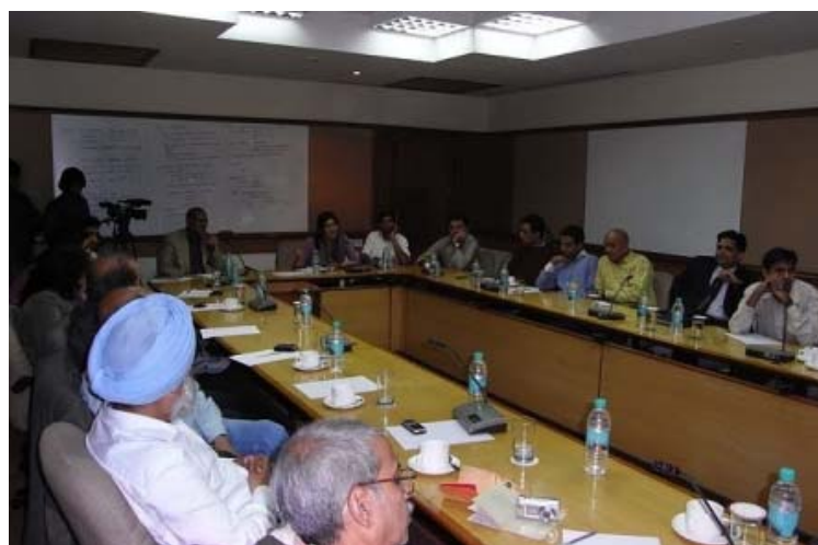
27 February: Five FTI members spoke at ASSOCHAM House, Delhi (the event was video-taped)

3 March Delhi : I had a two hour conversation with few people at the Centre for Civil Society, Delhi, organised by Chintan CCS. This discussion was focused on organisational issues related to FTI, and what other liberal organisations could potentially learn from FTI's (limited) experience.