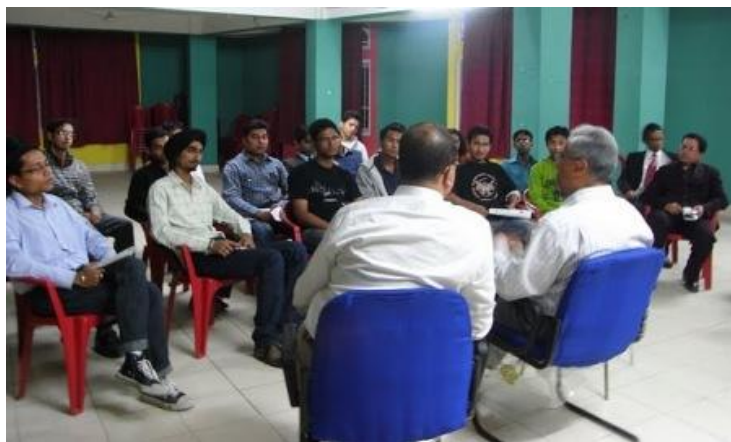
18 February: A talk on FTI to students at the Darwin School of Business, Guwahati

27 February Delhi : I spoke (along with four other FTI members) to a fairly largish group at ASSOCHAM house, Delhi organised by Liberty Institute and IFAN.