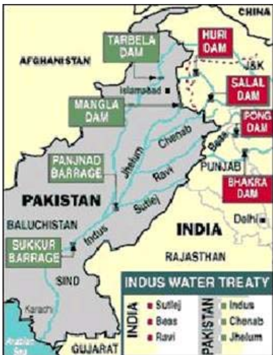
Major Tributaries and Dams of Indus Water System

Like most of the problems of Indian sub-continent, genesis of Indus water dispute lies in the hasty partition of the sub-continent into India and Pakistan. Indus water system was the main source of irrigation for mostly farming population of undivided Punjab, and still is. Both India and Pakistan are agrarian economies although things are changing on Indian side but that is a separate discussion.