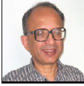
Swaminathan S. Anklesaria Aiyar